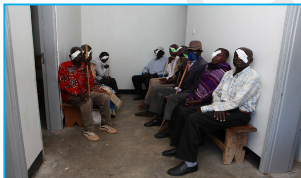
Waiting for removing the eye bandage