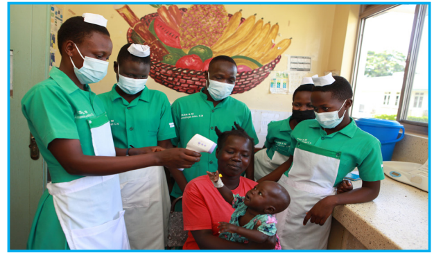
Students from the Nursing and Midwifery school