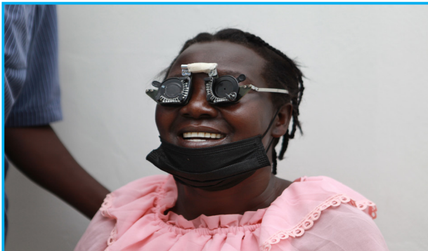
Eye measurement for the strength of the glasses