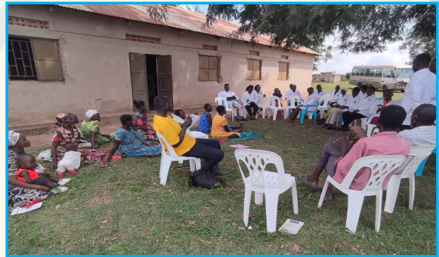
Students from the University of Health Sciences Soroti