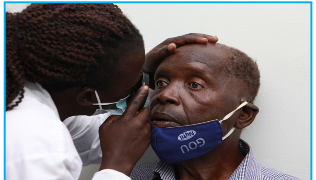
First check of the patients