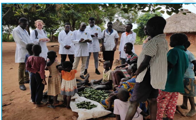
Community Dialogue at the Health Facility