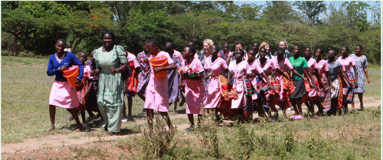
A special welcome at the Adesso Primary School

attention is being paid to where, especially with only a little help, a big difference can be made. The aid is future-oriented and strives for progress and self-reliance.