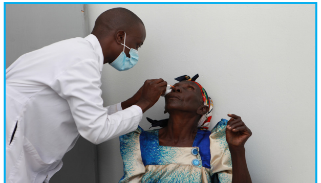
Eye drops for maximum relaxed eyes

The medical team screened a total of 153 patients, of which 88 patients had surgery caused by cataracts, 2 patients with excisions (surgical removal) and 63 patients with other eye diseases.