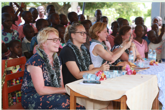
As a special guest at the Adesso Primary School