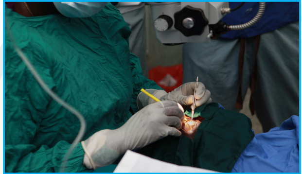
Surgery of the eye