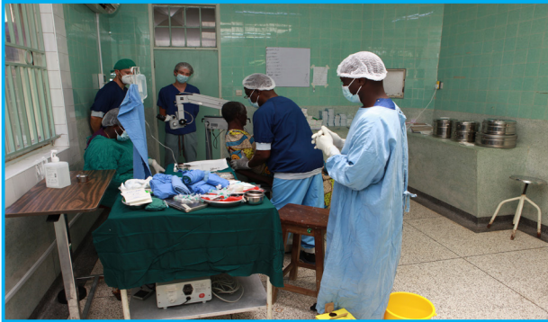
Preparation in the operating room