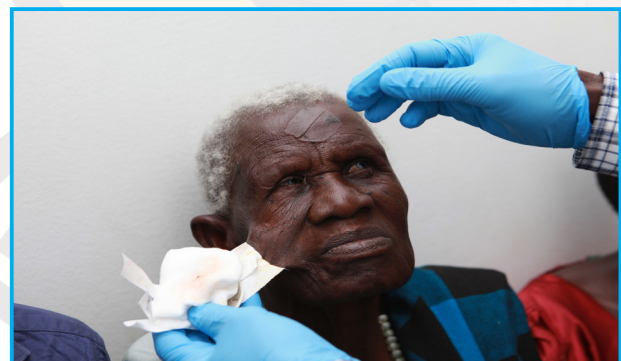
Clear new sight after years

M any thanks to the ophthalmologist and team members for the coordination and great work that has made the camp a great success. We also thanks the KH management and eye department staff for the succesfull eye camp.