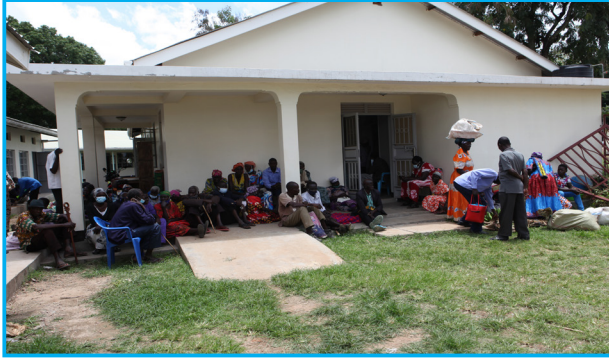
OPD Eye Department

The team members of the eye camp offered an eye check and with the eye care facilities in the eye department they offered a direct treatment with overnight accommodation in the renovated eye ward. Also this time, the patients only had to contribute a small amount for the eye surgery.