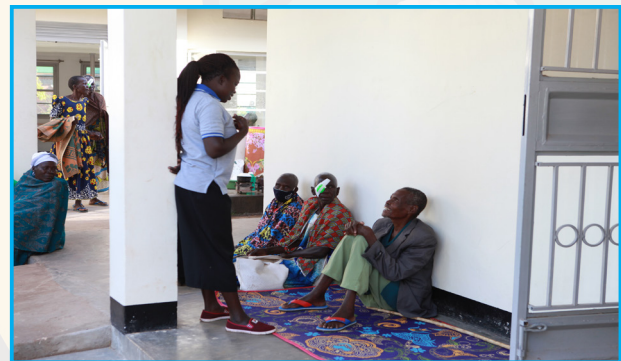
Checking the Post-Operatives