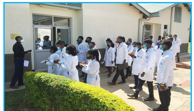
Physiotherapy students from Mulago Kampala