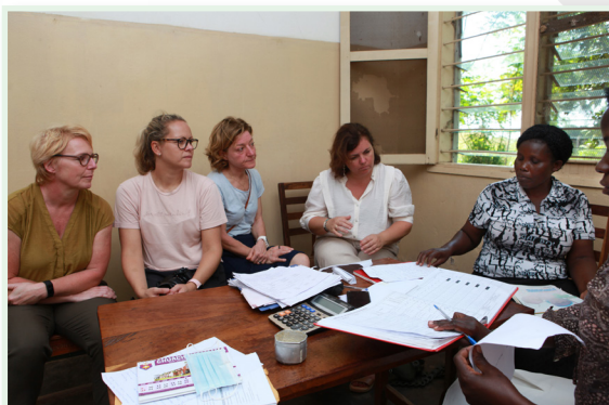
At the Nutrition Department