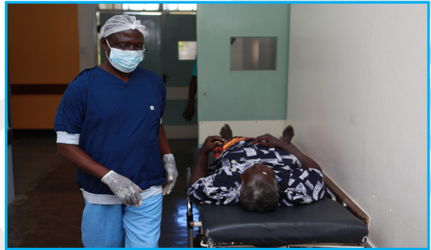
Anasthesia of the patient's eye