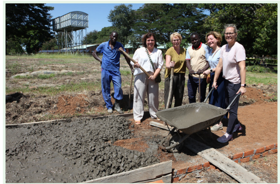
At work at our latest foundation Walkway project

foundation is enormous. How special to experience it up close.