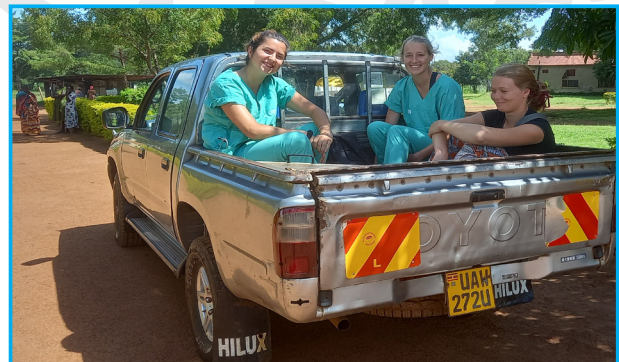
Medical Elective Students from Europe