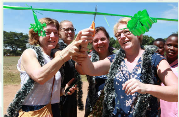
Opening of a renovated Classroom and Office