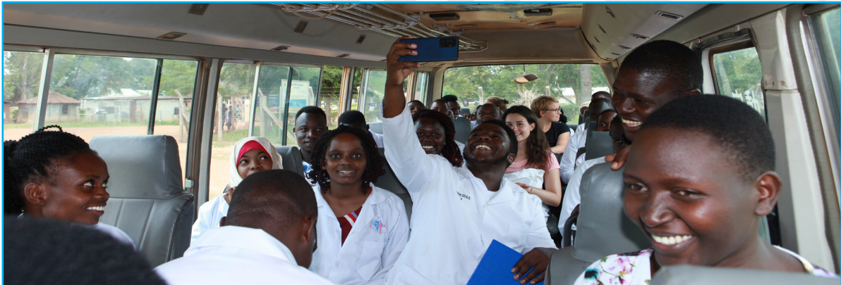
Travel to the Community Site