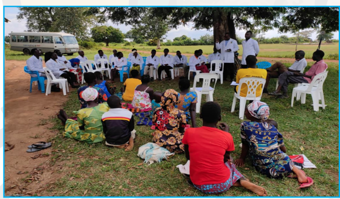
Community Dialogue activity

T his program was a great experience; enlightening and educational academically for all of us.