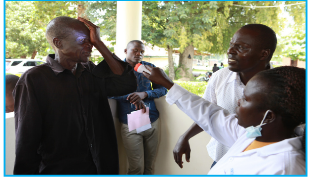
Screening of the patients