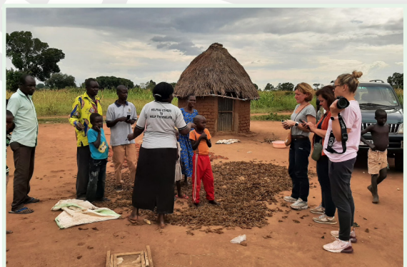
KH Outreach; Nutrition, Disability and Malnutrition